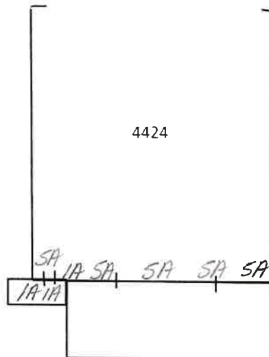
Diagram not to scale, findings at approximate location, not for escrow purposes.

Inspected By Parkinson, Jeff State License No FR 8399 Signature Jeff Parkinson You are entitled to obtain copies of all reports and completion notices on this property reported to the Structural Pest Control Board during the preceding two years. To obtain copies contact: Structural Pest Control Board, 2005 Evergreen Street, Suite 1500, Sacramento, CA 95815.